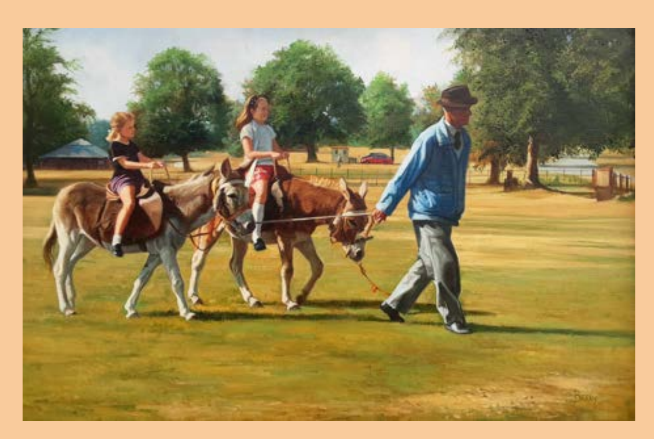
'Donkey Rides in the Park - English Girls' Oil on canvas 20x30" £3300