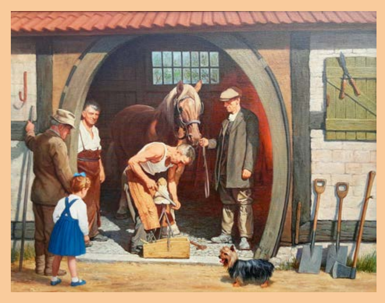
'New Shoes for Sandy' (The Horse Shoe Forge, Claverdon) Oil on canvas 28x36" £5500