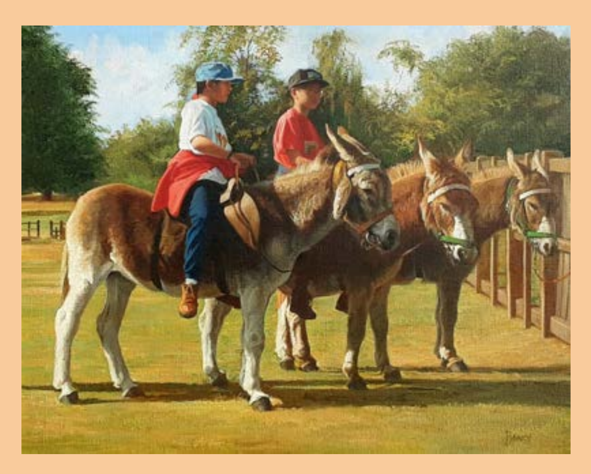
'Donkey Rides in the Park - Japanese Visitors' Oil on canvas 16x20" £2000