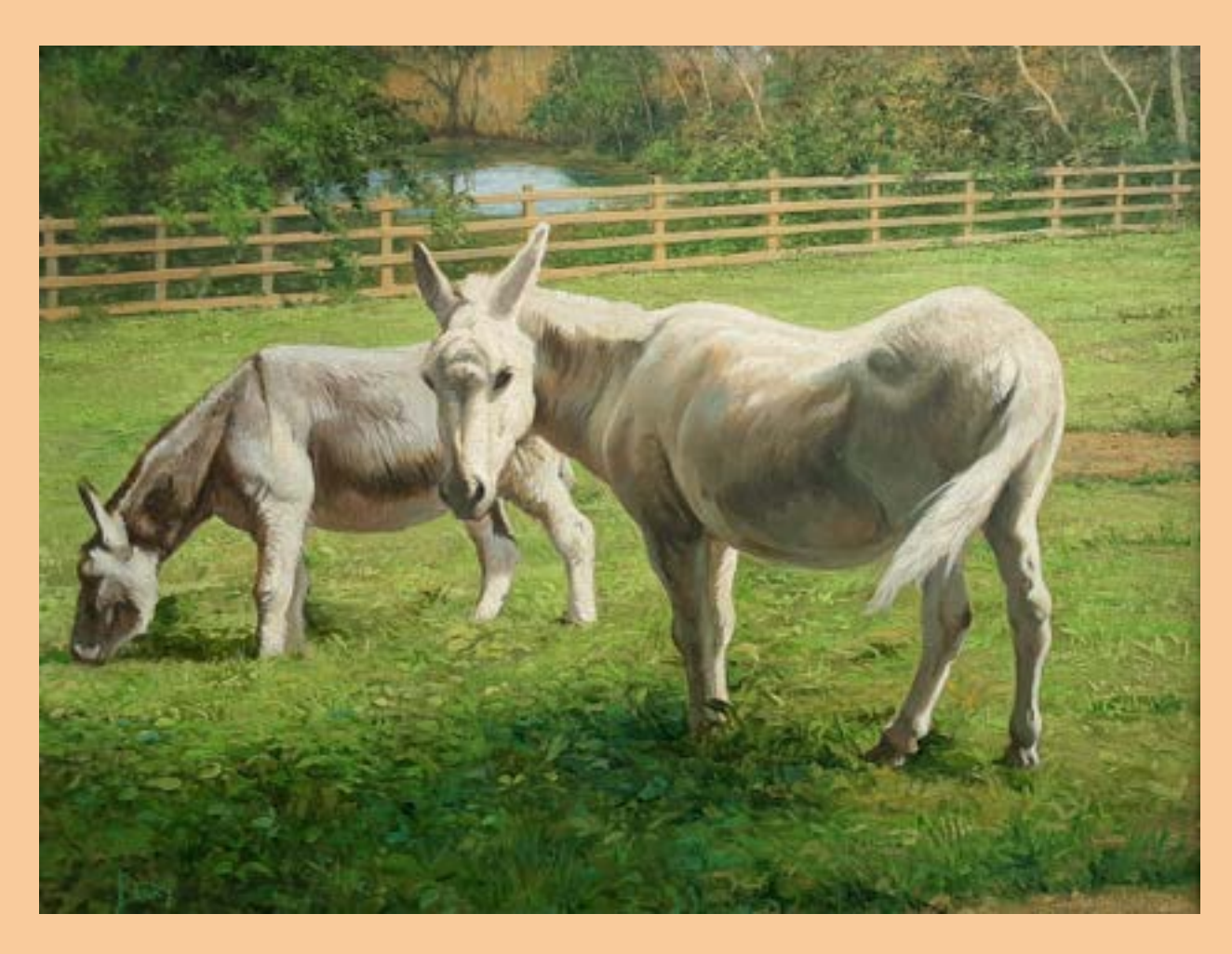
'Caesar and Dinkie in the Lush' Oil on panel 16x20" £1650